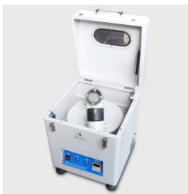
Figure 1 ZB500S, solder paste machine

Copprint LF-350 should be stored below -10°C. Mix the paste in the original container before printing using a paste mixer (Figure 1) - Eg. ZB500S, solder paste mixer, 15min at 300rpm, or manually until homogeneous in composition throughout.