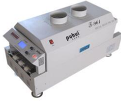
Figure 2 Reflow Oven

After printing, dry the pattern immediately. Drying in a conveyor belt oven with hot air is recommended. For lab scale testing we use a Reflow oven T-961 from Puhui ( www.puhuit.com )