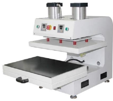
Figure 4 Heat press machine