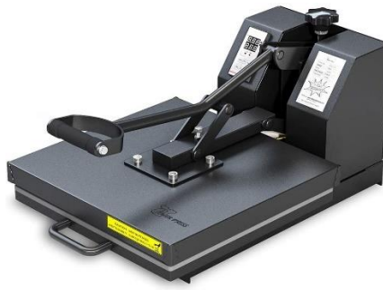
Figure 5 Manual 200$ Heat press machine